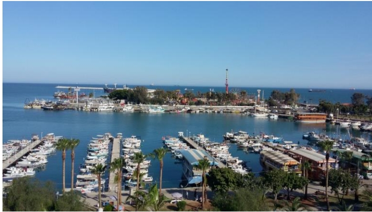
WELCOME TO MERSIN