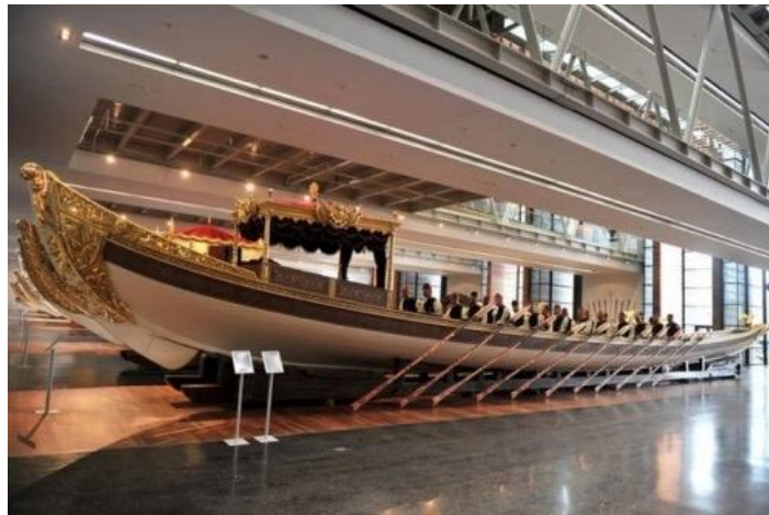
Museum of Marine